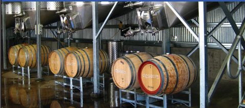
5 TONNE OPEN TOP FERMENTERS