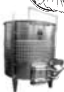
Variable Capacity Tanks