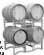
Oak Barrels & Racks