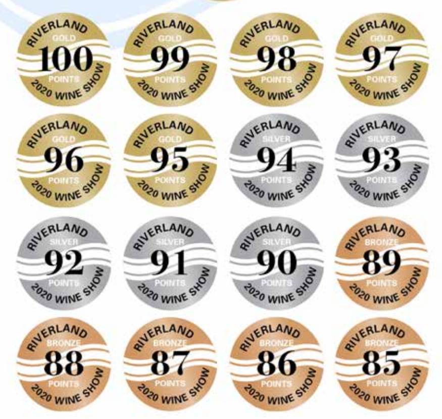
We've moved to 100 Point System MAKE THE MOST OF YOUR RESULTS